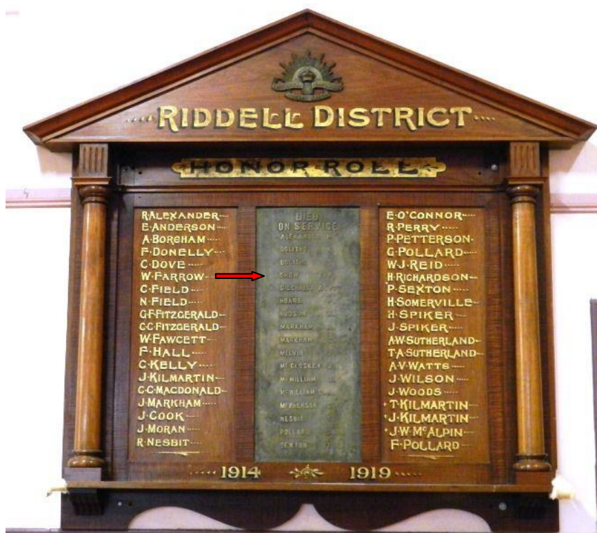
Riddell District Honor Roll