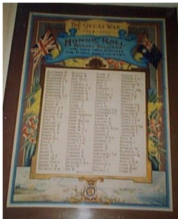
Honour Roll of Romsey Soldiers